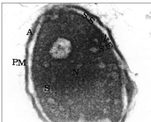
Figure 3: SEM image of a longitudinal section of an abnormal sperm head belonging to the group with high fluorescence rate. Nucleus is observed with insufficiently condensed chromatin and irregular sperm plasma membrane (PM), acrosome (A) and nuclear envelope (NE). Acrosome (A) and subacrosome space (SS) do not have uniform thicknesses in all places (magnification of \times 20000 )