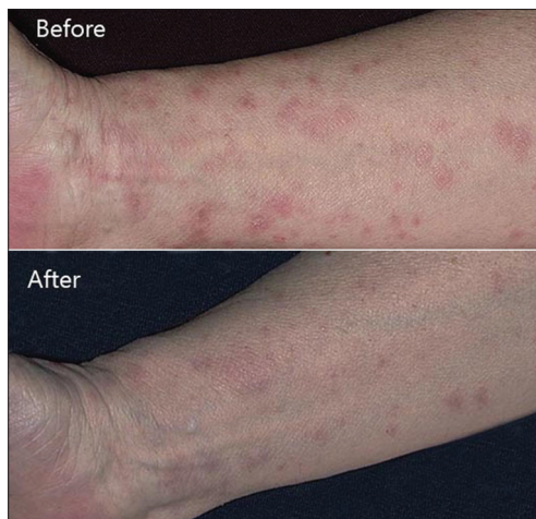
Figure 1: A Patient before and after treatment by subcutaneous Enoxaparin