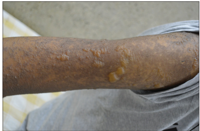
Figure 2: Lesions on the upper limb