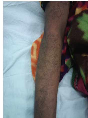
Figure 4: Improvement in the lesions of skin after treatment