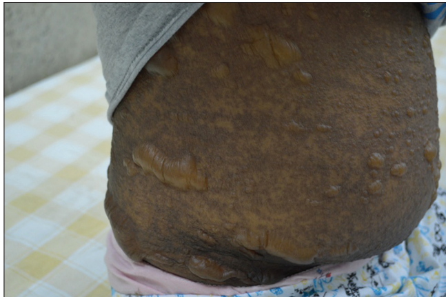
Figure 1: Skin lesions on the trunk

There is a need for continuous reporting of such a rare life-threatening adverse effect of drugs in order to increase awareness and to prevent serious reactions like TEN. This can be confirmed by further detailed assessment of adverse drug reactions which can be performed by using the World Health Organization's (WHO) causality, Naranjo's algorithm and Hartwig scale.