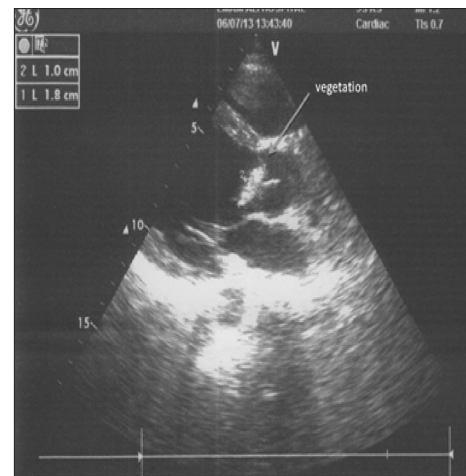
Figure 1: Vegetation and fistula formation