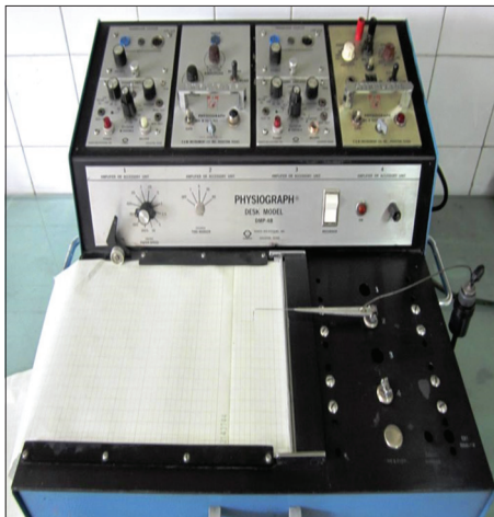
Figure 2: Physiograph device

from the positive peak point to lowest negative point and expressed by microbial after calculation and conversion of units.