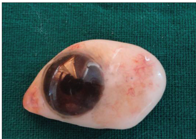
Figure 8: Final ocular prosthesis