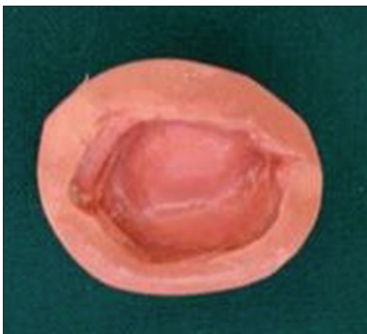
Figure 4: Two piece split cast mold