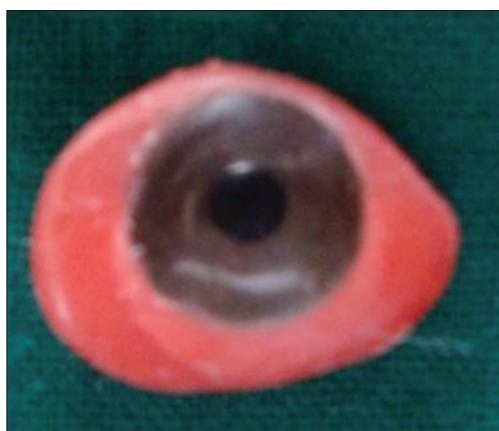
Figure 6: Scleral wax pattern with trimmed and embedded stock iris