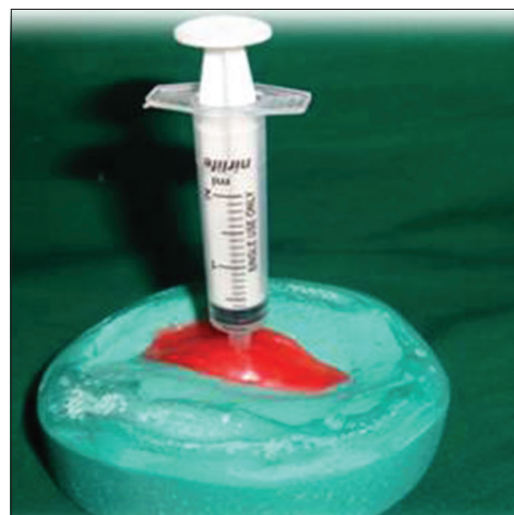
Figure 2: Syringe attached for fabrication of custom tray