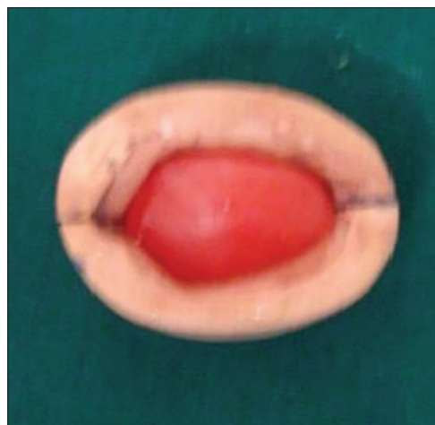
Figure 5: Fabrication of wax pattern in the mold