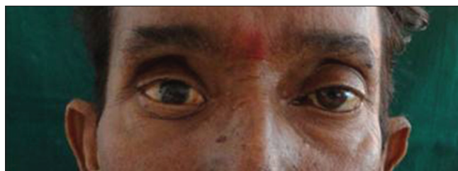
Figure 9: Final prosthesis in the socket

The authors certify that they have obtained all appropriate patient consent forms. In the form the patient(s) has/have given his/her/their consent for his/her/their images and other clinical information to be reported in the journal. The patients understand that their names and initials will not