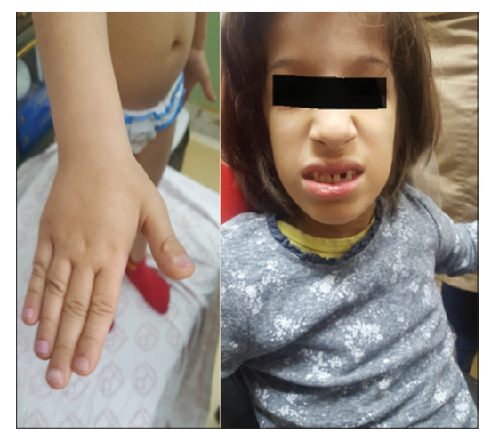
Figure 1: Patients appearance. This photograph presents facial dysmorphism including; a triangular face, pointed chin, sparse hair, nail hypoplasia, brachydactyly, crowded teeth and frontal bossing

In the 6<sup>th</sup> month, she underwent another echocardiography again. This one presented that ASD and VSD have repaired spontaneously, but PDA had remained. Thus, she underwent surgical repair for her PDA when she was 8 months. As