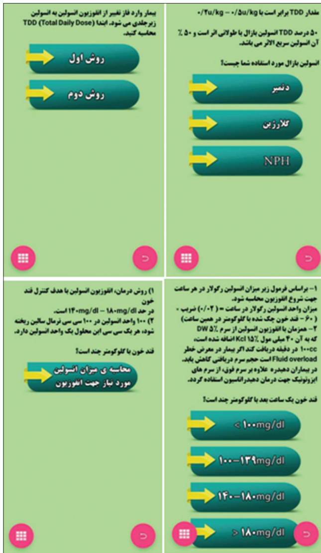
Figure 2: Some screenshots of different parts of the app

described the application to be user-friendly (high and very high). Moreover, 69.3% reported the application to be very necessary for health providers, especially physicians [Figure 2]. More than 77% of physicians described that the design of application is appropriate, 88% mentioned that the texts are understandable and legible, and 80.4% described the different steps of application are well sequenced. Based on the appraisal, the application has helped physicians in course of treatment process. Using the software was easy for the vast majority of physicians. More information is provided in the Table 1.