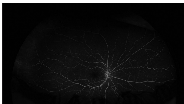
Figure 2: Ultra-widefield fundus fluorescein angiography showed chorioretinal scar in a patient with unilateral Fuchs' uveitis syndrome