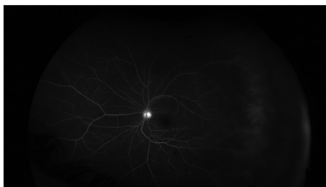
Figure 1: Ultra-widefield fundus fluorescein angiography showed retinal capillary nonperfusion and optic disc hyperfluorescence in a patient with unilateral Fuchs' uveitis syndrome

The reported ODH rate varied between 22% and 97.7%. [2-4,13] ODH was seen in 85% of the patients in the