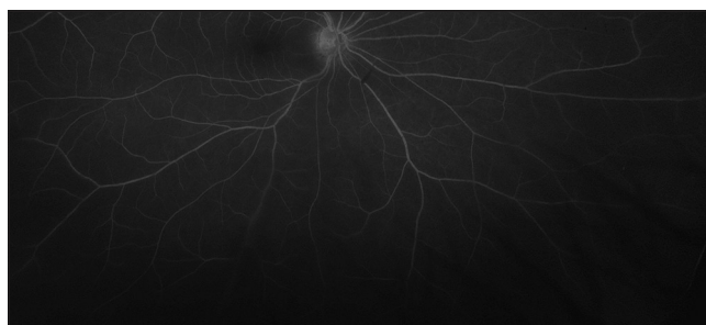
Figure 3: Ultra-widefield fundus fluorescein angiography showed vascular sheathing in a patient with unilateral Fuchs' uveitis syndrome