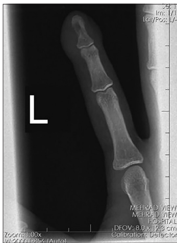
Figure 2: Roentgenogram showing a lytic lesion with ill-defined borders and swelling without calcification of soft-tissue